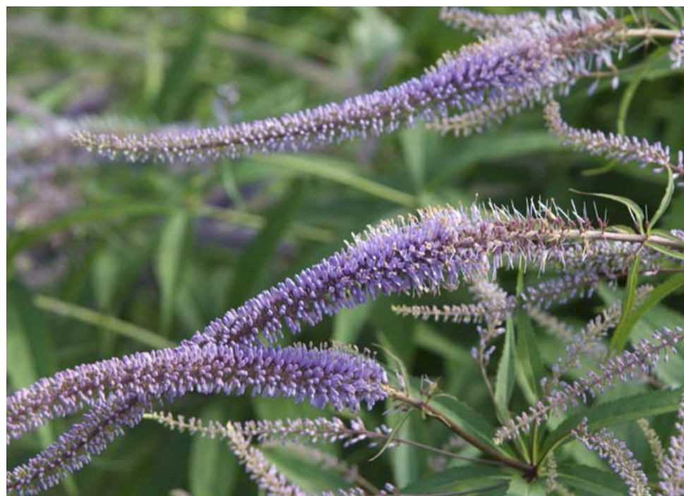
Veronicastrum virginicum 'Pointed Finger' (above), with its horizontally held flower spikes, is well named

'An open, sunny site, not in the shade of trees or shrubs or surrounded by other tall perennials is ideal. Eryngiums look great in a gravel garden and once established tolerate dry conditions.'