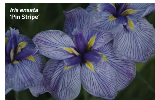
Iris ensata 'Pin Stripe'

Elizabeth has strong opinions on what makes a good plant ('I don't like miffy plants,' she says) and a cursory glance in the walled garden and stock beds amply bear this out. She is also active in breeding and selecting better perennials and has achieved successful results in a