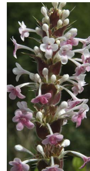
Strident Potentilla 'Flamenco' (above) and more delicate Morinia longifolia (above right)

The RHS Flower Show at Tatton Park 23-27 July 2008 (23 July: RHS Preview Day). Visit www.rhs.org.uk/flowershows for full details or to book tickets. To order tickets by telephone, call 0870 842 2223