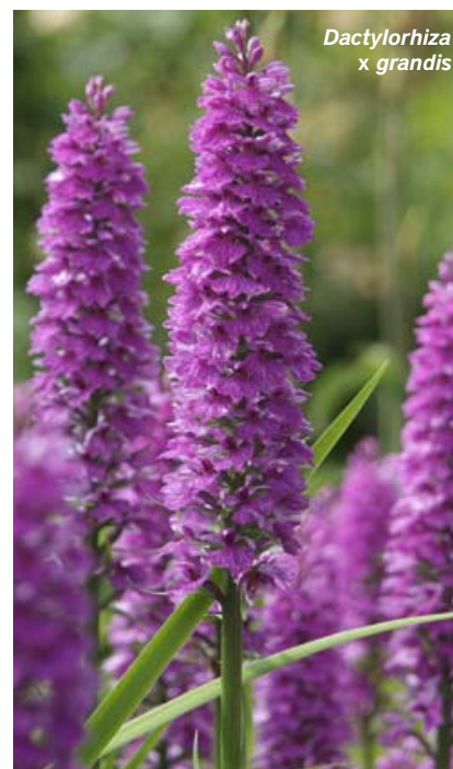
Dactylorhiza x grandis

The iris was more contained in habit, growing happily in what appeared to be a normal but regularly mulched soil, its erect 60cm stems branched above, each arm supporting a large rounded